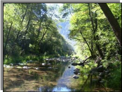
Stream with banks protected by a forested riparian cover. Just beautiful.

Streamside plants protect your property by slowing runoff and allowing it to soak into the ground, recharging wells and reducing flooding. Roots of plants in the buffer help hold the soil and control erosion. Trees shade the stream to keep it cool for aquatic life and provide habitat for birds and other wildlife. Buffer plants can provide seasonal blooms and autumn color to beautify your yard while providing protection. Buffer zones can also add to the value of your property.