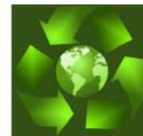
Keep It Safe