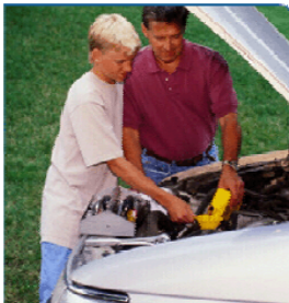
Be responsible with used motor oil today and for future generations.

The next time you change your own oil, you can make a difference by recycling the oil from your car, truck, motorcycle, boat, RV or lawn-mower.