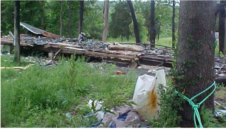
Base of burned mobile home to be removed