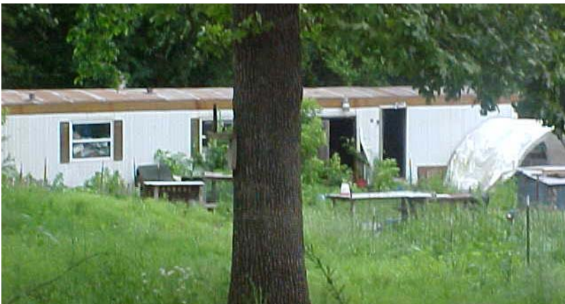
Mobile Home to be removed