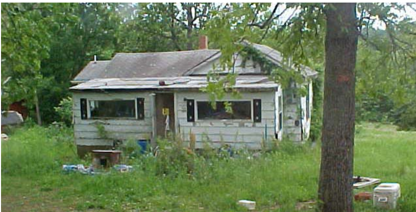
House to be removed