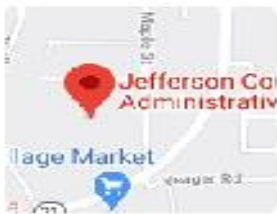
Photo - Nov 2017