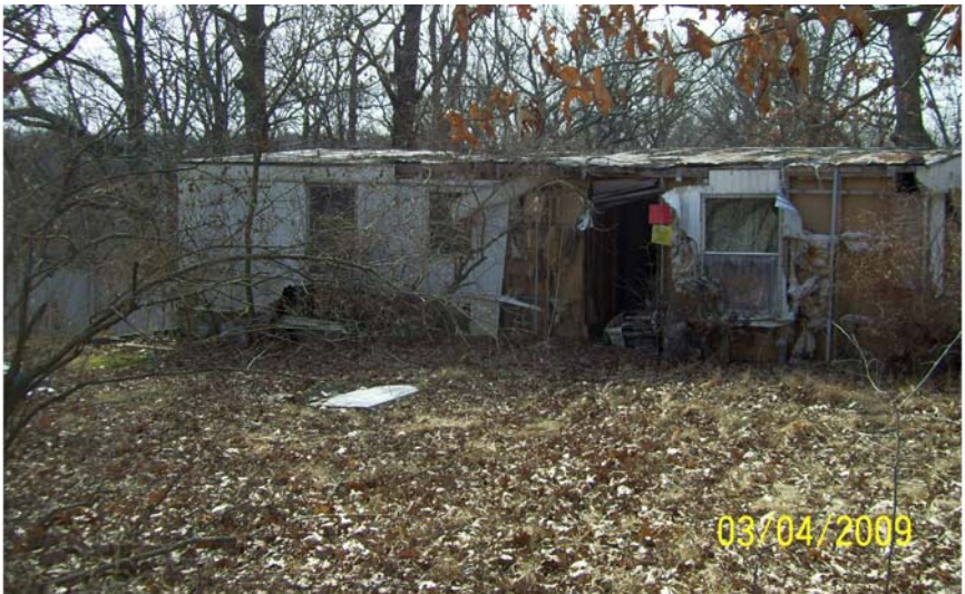
Mobile home to be removed.