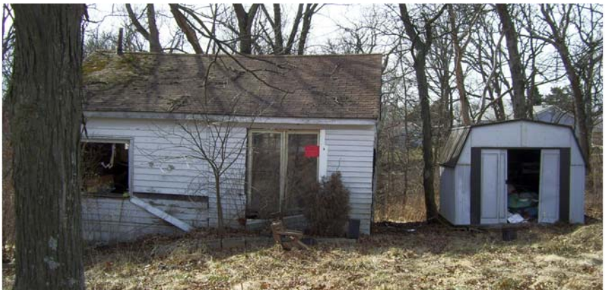
Shed/garage to be removed. White small shed on right is not to be removed.